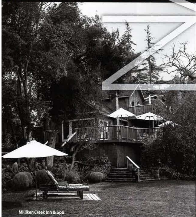
Milliken Creek Inn & Spa